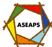
ASEAPS - Association of Southeast Asian Pain Societies